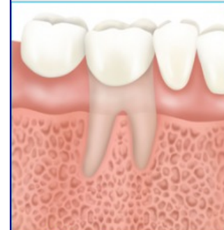
Referral to Surgeon