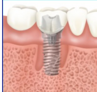
Custom Abutment Implant Crown